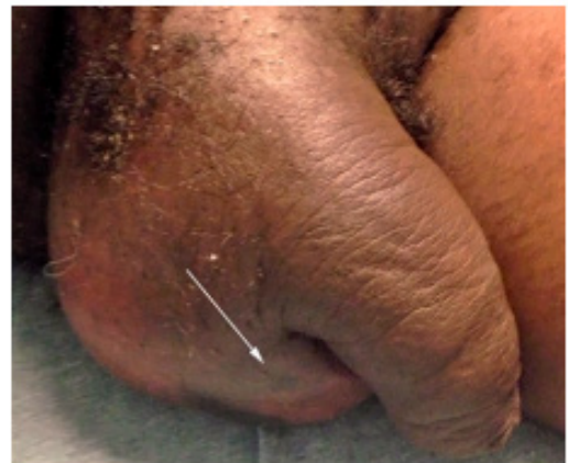
Fig 1. Image of the patient's penis and scrotum demonstrating significant soft tissue swelling and an area of skin discoloration (arrow) of the inferior left scrotum.