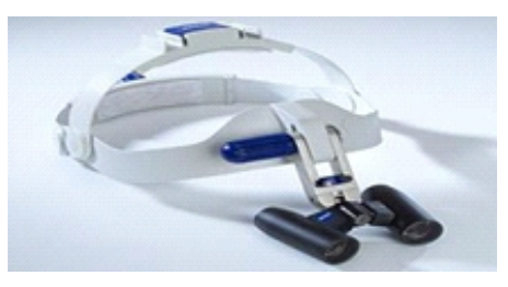
Fig 5-PRISM LOUPES MOUNTED ON HEADBAND

C. Prism loupes - Prism loupes are the most optically advanced type of loupe magnification presently available. These loupes actually contain Schmidt or roof-top prisms that lengthen the light path through a series of mirror reflections within the loupe (Fig 5). They lengthen the light path by virtually folding the light so that the barrel of the loupe can be shortened. They are superior to other loupes in terms of better magnification, wider depths of field, longer working distances and larger fields of view. The barrels of prism loupes are short and can be mounted on eyeglasses or a headband. But the increased weight, at magnifications of 3.0 diameters or greater, causes headband mounted loupes to be more comfortable and stable than mountings on glasses.