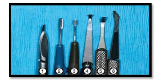
Fig 2-Periodontal microsurgical knives.

Periodontal microsurgical knives(Fig 2): 1- blade breaker; 2-crescent; 3-minicrescent; 4-260° spoon; 5- lamella, and 6- sclera