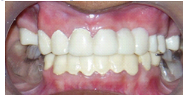
Fig4 - provisional restorations were placed