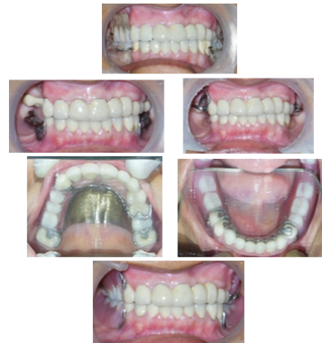
Fig 5- Sequential definitive restoration