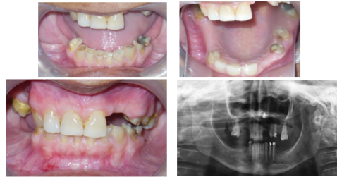
Fig 1-preoperative intraoral view and radiograph

restoration, the amount of occlusal adjustment on the lingual surface of maxillary anterior teeth was minimal. Individual tray with polyvinylsiloxane (affinis, coltene) was used for the impression of mandibular cast partial denture. The impression on posterior alveolar ridge was taken once more with the individual tray which is attached to the CPD framework, and the altered cast was made. After the adaptation of CPD framework and the trial of wax denture were done, the definitive mandibular RPD was fabricated and delivered with minor occlusal adjustment (Fig. 5,6). The prostheses were designed using mutually protected occlusion. The anterior teeth protected the posterior teeth from excursive force and wear, and posterior teeth supported the bite force. Oral hygiene instruction and regular check-up were administered.