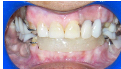
Fig 2- occlusal overlay splint was delivered for 8 weeks in new vertical dimension