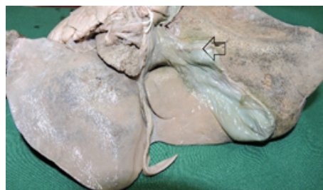
Figure 1: Specimen indicating Hartmann's pouch

The diverticula found in the present study were congenital, i.e., true diverticula, as they were solitary, external outpouching of the gall bladder wall, without calculi and without any breach of mucosa. No internal saccular lesions were observed in the interior of the gall bladder. No pathology was detected in these specimens.