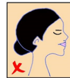
Bun at wrong places