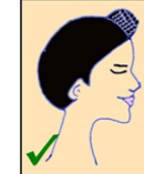
Pony made as bun on top