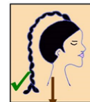
Pony on top