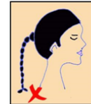
Pony at occiput