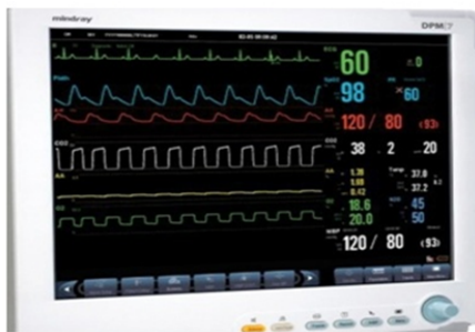
Figure III. Intra operative monitoring

All measures to maintain hypoxic pulmonary vasoconstriction (HPV) were taken. Intermittent suctioning was performed. Intraoperative ABGA revealed satisfactory oxygenation. Thoracotomy ligation of fistula was performed. Bronchial stump integrity was checked by applying positive end expiratory pressure (PEEP). Esophageal plaything was sutured. Intraoperative 2 packed cell volume (PCV) total 480 ml and 1000 ml NS and 500 ml RL and 500 ml DNS given. Urine output was 1350 ml at the end of surgery. Intraoperative period was uneventful with no complications. Reversal was started after return of spontaneous respiratory attempts. Patient was given inj glycopyrrolate (8 mcg/kg) IV and inj neostigmine (0.05 mg/kg) IV. After through suctioning DLT removed. After extubation patient was conscious and following verbal command. Patient was given nebulisation with salbutamol and budesonide. Post op ABGA was within normal limits. Duration of surgery was 4.5 hr and post op patient was stable and shifted to ICU for observation. Contrast esophagogram performed after 10 days showed "NO LEAK" and ICD was removed after which she was discharged.