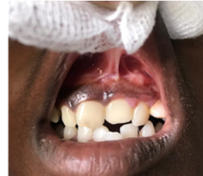
Fig 2 showing small cystic swelling over the left gingiva buccal sulcus above