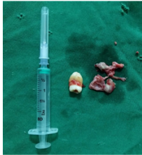
Fig 6 showing excised cyst with unerupted tooth.