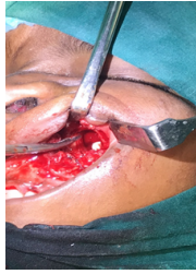
Fig 5 Fig 4 & 5 showing intra-op pictures