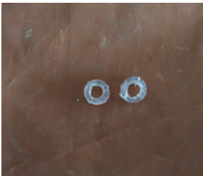
Figure 3 – Silicone gaskets corresponding to diameter of canine and premolar

Two gasket rings made of silicone rubber were selected to a diameter corresponding to the diameter of a canine and premolar (Fig. 3). The rings were altered to fit snugly and passively on the cervical margin of 13 and 24 (Fig. 4, 5). There is a risk of extreme thinning of the denture base in the final denture in 13 and 24 region. Hence, the buccal area above 13 and 24 was reinforced by placing a small piece of 21 gauge wire. The rings were secured in position by waxing it along with the denture base (Fig. 6, 7). Maxillary waxed up denture was flasks using conventional flask and clamp with type 3 gypsum. [Kalstone, Kalabhai, India].