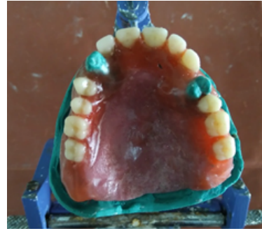
Figure 6 – Waxed up denture with the silicone rings