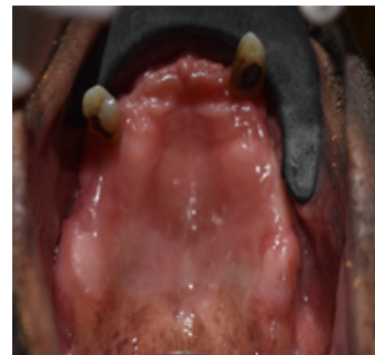
Figure 1 – Pre-operative maxillary arch with presence of 13 and 24

On intra oral examination the patient had a Kennedy class 1 modification 1 edentulous space in maxilla with presence of only 13 and 24 (Fig. 1) and Kennedy's class 2 edentulous space in mandibular arch with missing 34, 35, 36, 45, 46, 47 and 48. Patient was already a denture wearer with a satisfactory lower denture but poor retention and esthetics in upper denture. On examination of individual teeth, 13 and 24 had gingival recession in them and the mandibular teeth were supra-erupted.