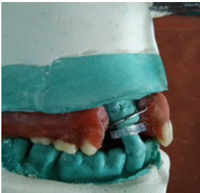
Figure 4 – Silicone ring fit snugly around the canine and reinforced with 21 gauge wire