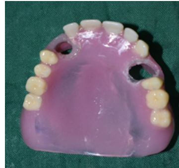
Figure 8 – Processed denture with silicone ring

Dewaxing was done and any residual wax was manually removed. A thin layer of separating medium [Cold Mold Seal, DPI India] was carefully painted over the stone taking care not to touch the silicone rings. Polymerization was done using conventional heat curing technique. Once the denture was processed, the flask was bench cooled for 30 minutes. Deflasking was done to retrieve the denture using hammer and plaster knife. The finished and polished denture (Fig. 8) was inserted into the patient's mouth. The silicone ring was adjusted chair side to allow passive seating on the tooth (Fig. 9). Review showed that the patient was comfortable in using the denture and his previous problem of retention was also solved.