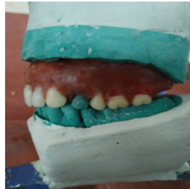
Figure 7 - Waxed up denture with the silicone rings

Dewaxing was done and any residual wax was manually removed. A thin layer of separating medium [Cold Mold Seal, DPI India] was carefully painted over the stone taking care not to touch the silicone rings. Polymerization was done using conventional heat curing technique. Once the denture was processed, the flask was bench cooled for 30 minutes. Deflasking was done to retrieve the denture using hammer and plaster knife. The finished and polished denture (Fig. 8) was inserted into the patient's mouth. The silicone ring was adjusted chair side to allow passive seating on the tooth (Fig. 9). Review showed that the patient was comfortable in using the denture and his previous problem of retention was also solved.