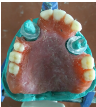
Figure 5 – Silicone rings in place