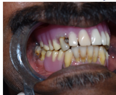
Figure 9 – Post operative intra oral view with denture