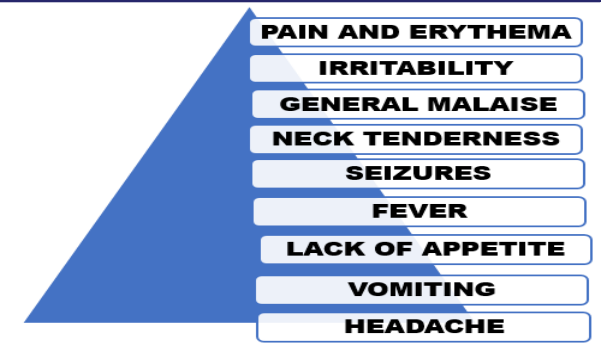
Fig 3. Clinical Features And Chief Complaints Of Vp Shunt Revision Patients

Clinical features and chief complaints of VP shunt revision patients were found to be headache (52%), vomiting(22%), lack of appetite(16%), fever, neck tenderness, seizures, general malaise, irritability, pain and erythema with headache and vomiting being most common.(Fig 3)