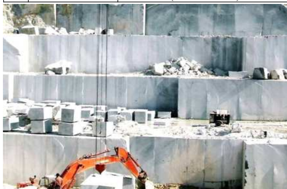
Photograph 1: Semi-mechanized Marble Mine at Rajsamand

Mining of marble is different from conventional mining of other minerals. In conventional mining method, mined out minerals are obtained in small-size fractions whereas in marble mining, large size intact blocks without minor cracks or damages are extracted. In the state the open-cast quarrying of marble is done by semi-mechanized and mechanized means (Photograph 1). The semi – mechanized/mechanized mining consist of operations like (1) Removal of overburden (2) Preparation of block (3) Separation of block and (4) Transportation of block to the processing units. In general, the percentage recovery of marble blocks on the whole is low and it varies from 25 to 45 %. However, in recent days modern techniques like diamond wire saw and chain saws are being used to minimize the waste. The marble blocks are being produced into different sizes ranging from 10' X 6' X 5' (Large block) to 3' X 2' X 2' (Small blocks), depending upon the nature of deposit and buyer's choice.