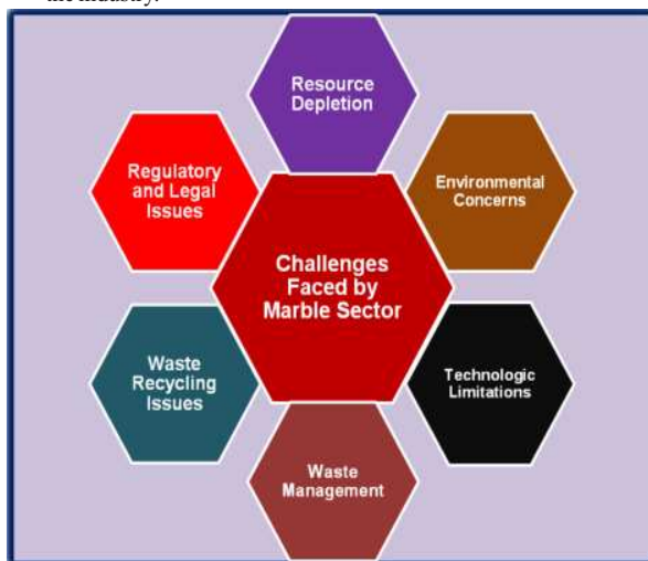
Figure 2: Challenges Faced by Marble Sector in Rajasthan