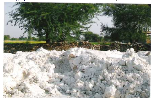
Photograph 3: Marble Slurry: A Major Challenge of Marble Sector