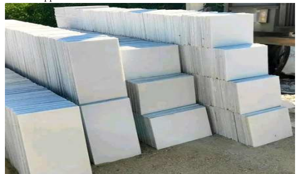
Photograph 2: Marble Slabs Obtained After Processing Of Block

The rough and unpolished marble block, firstly received from mines is unloaded in the gantry yard with the help of gantry cranes. To remove the non-uniform surface of blocks, they are dressed on dressing machine before shifting to gangsaw machines. Each saw is brazed with number of segments called diamond segments. These segments act as teeth and cut block into required thickness. Throughout the cutting process of marble block, water as coolant is continuously sprinkled on block to reduce the heat generation. During the cutting process the marble block also generate fine marble dust which got intermixed with water and formed "marble slurry". About 20-25 % of the marble block processed results into marble slurry (Photograph 3). The marble slurry has nearly 35%-45% water content. The marble slabs and tiles which are being produced in processing units are variable in size and thickness (Photograph 2). Marble slabs having lengths ranging from 70 to 250 cm, widths 30 to 100 cm and thicknesses from 20 to 150 mm. The tiles have preferably sizes of 10 x 10 cm, 20 x 20 cm, 30 x 30 cm, 40 x 40 cm, 50 x 50 cm and 60 x 60 cm with thickness ranging from 18 to 24 mm. Other sizes as agreed upon by supplier and purchaser may also be supplied.