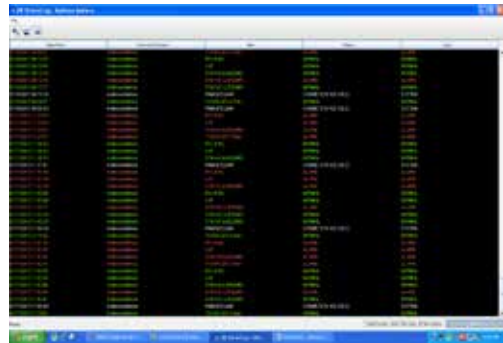
Figure 5.2 Acknowledgment 2