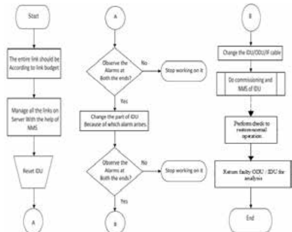
Figure 3.2 Flow chart of trouble shooting Method.