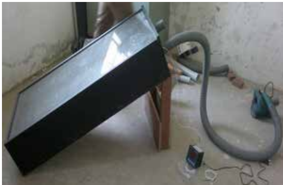
Fig 2.1 Experimental set up of Modified Solar air heater with Amul Cool Aluminium Cans and Corrugated Absorber Plate

Fig 2.1 Shows experimental set up of double pass solar air heater. In this study, absorber plate made of stainless steel with black chrome as a selective coating material to increase absorptivity of solar radiation. Dimension of solar air heater is 2 meter × 0.75 meter × 3 m respectively. Instead of normal window glass, toughened glass has utilized in this research work. Thermal losses of cover due to convection as well as radiation process are assumed as constant. Due to corrugated shape of absorber plate, easily air flow will occur so no vent is required in solar air heater. 40 Amul cool Aluminium cans have used to create obstruction on the way of air and to increase temperature as well as thermal efficiency of solar air heater. Each Amul cool Aluminium can was opened on top as well as bottom to receive air flow from it. There surface get sealed to absorber plate with help of M seal. Here, Ther-