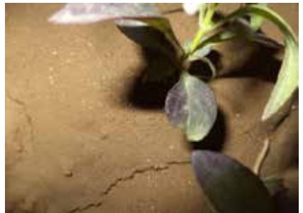
Fig.5: Seeds irradiated at 10 KR % \left( {{\rm{S}}_{\rm{R}}} \right) shows leaf color change to violet