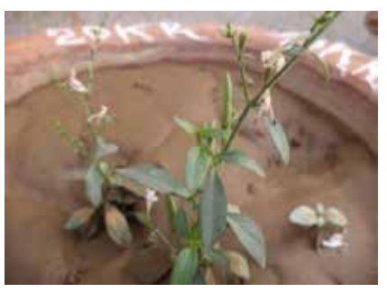
Fig.7: Seeds irradiated at 20KR shows plants growth