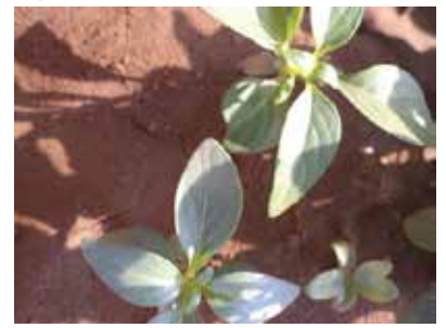
Fig.2: Seeds irradiated at 10 KR shows different types of leaf shape

Fig.1: Seeds irradiated at 10KR shows plants growth