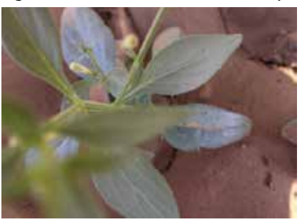
Fig.8: Seeds irradiated at 20 KR shows different types of leaf shape.