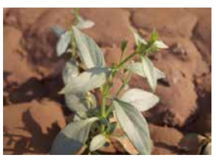
Fig.6: Seeds irradiated at 20KR shows plants growth