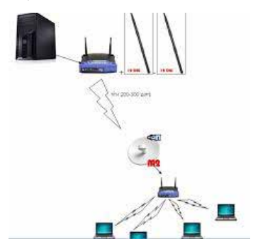
Fig(1) System Structure

structure of the system is the need to two Nano Tower and cable length of 20 meters with a distributor router and when linking nanotechnology tower and column length of 6 meters and be directed towards the Tower second column erth link then linking nanotechnology Tower II in a column Erthlink and this after the broadcast special frequency within the prompt differ broadcast to others and this our connecting point to point and does not have any loss in this link of data with proper antennas and clear line of sight reliable point to point in excess of thirty kilo meters are possible and there is no any effects or frequencies affect the data access and when wiring cable and connects to router will then be broadcast in the form of Wireless and work Broadband for each calculator connected on the net has been calculated signal before and after the link points to points, according to the table below fig(1)