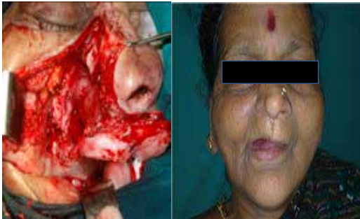
Intra-operative And Post Operative Images of case 1

CASE 2- A 67 year old male patient was referred from the ophthalmic department to rule out any ENT cause for the left sided, medial orbital swelling of three months duration. Vision was 6/12 in the left eye. The patient had a past history of left dacryocystectomy six years back, for complaints of bleeding from the same site, the histopathological diagnosis was transitional cell carcinoma. Diagnostic nasal endoscopy revealed a polypoidal mass in the left middle meatus. Biopsy was taken which came as sinonasal transitional cell carcinoma. C T scan revealed a well defined homogenously enhancing extraconal lesion in inferomedial aspect of left orbit involving the maxilla, ethmoid and frontal sinuses. Lesion was displacing the globe superolaterally indenting the inferomedial aspect of left globe with suspicious infiltration of globe and inferior oblique muscle. The patient underwent left fronto ethmoido maxillary resection with orbital extentionation. The patient was advised post op CTRT but the patient was lost to follow up after three months.