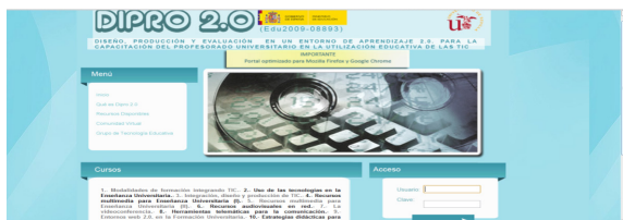
Figure 1: DIPRO 2.0 environment portal

For students who were attending in the academic year 2011-2012 that subject could access the contents of the thematic "Web Quest" were assigned a self to which assigned them a password, accessing the module via the platform DIPRO 2.0 (see fig. 1).