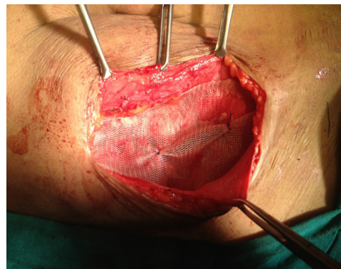
fig no.1 defect repaired with mesh

CT scan showing mass arising from anterior abdominal musculature revealed a large mass, measuring 5*5 cm arising from the right anterior abdominal wall musculatures. Fat plane to the surrounding organs appears normal. No enlarged lymph node or ascites were seen. No focal lesion was noted in bone or liver. Described CT imaging features were compatible with neoplastic anterior abdominal wall origin mass and considered for desmoid tumor. After preoperative workup, patient was planned for operation, and complete excision of the tumor with wide surgical margins along with the anterior abdominal wall down to the peritoneum was performed, resulting in a large wall defect which was