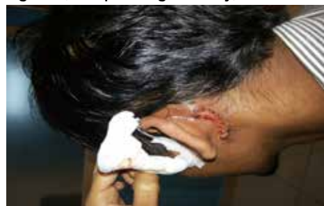
Figure 2 (Post operative picture)