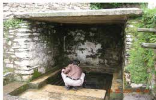
Fig III: Suggested pattern of taking water from the bauries: