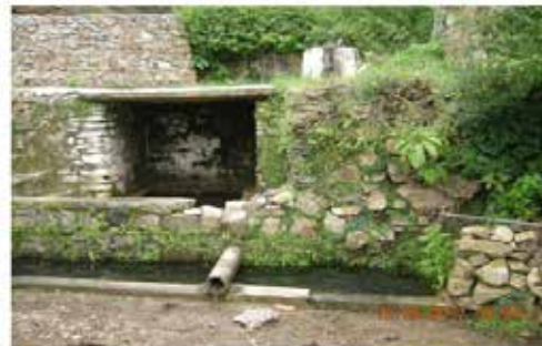
Fig II: Source of contamination by shoes as there is no protection boundary:-