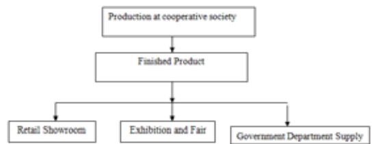
Flow chart on supply chain of handloom products

product from their unit sometime within the village and also through exhibition cum sale, fair and expo. Exhibition, fair and expos were organized by the Development Commissioner (Handloom and Textile, Government of Assam). Only few Weavers' Cooperative societies such 40 per cent of Weavers' Cooperative societies were using special sale counter of their own for marketing their product.