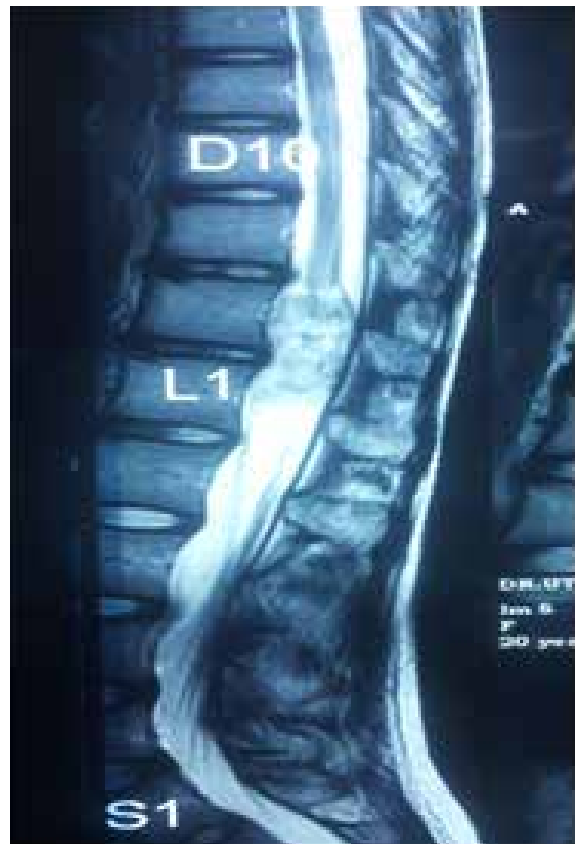
Fig 1; T2W Sag mri

tight manner. During surgery the blood loss was 400 to 500 ml. Patient recovered well, with no postoperative deficits. Postoperative MRI showed total excision (fig 3). Microscopic examination showed, cyst walls were lined with compressed stratified squamous epithelium with abundant keratin material, which was consistent with epidermoid cyst (fig 4).