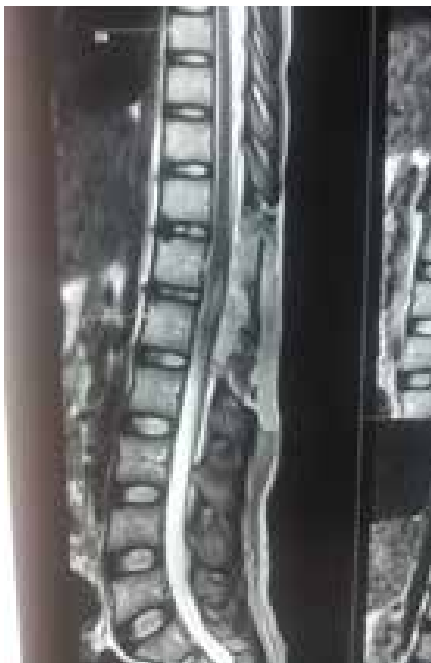
Fig 3; post op MRI