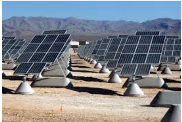
Figure 2. Heliostats field

The intensified sun light was supplied by Solar Research Facility Unit form Weizmann Institute of Science, Rehovot, Israel. The Solar Research Facilities Unit has a very sophisticated solar tower with a north field of 64 heliostats, 56 m 2 each, which on a bright day can collect 3 MW of solar radiation in total. The tower has 4 vertical experimental levels, 3 indoor and one outdoor on the roof for which special safety precautions are required for the tests. In addition, the facility has a unique 0.5 MW beam down facility, which has no equal in any other solar research facility in the world (Fig. 1).