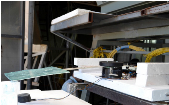
Figure 3. Cyborg arm

Robotic arm is made from a turn base with a servomechanism driven by an ATMEGA 16 microcontroller using PWM channel. The microcontroller is the main compound in control module and also is used to receive the signals from position sensor and from NI acquisition board. Also the signal for initializing I-V module is prepared here. In this purpose every duty is resolved in different task using different resource on microcontroller. The servomechanism is powerful in order to have the possibilities to move the protection in short time. It has a maximum couple of 6 kg at 1 cm and in 0.2 second it moves 60 degrees. In order to minimize the inertia moment at stop, this velocity is decreased at 60 degrees per second (5 times slower). The robot is presented in figure 3.