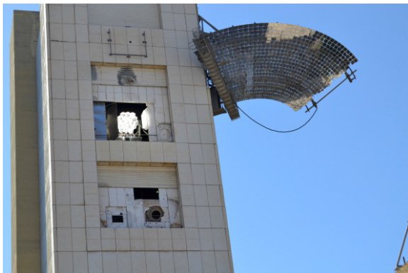
Figure 1. Solar tower

method consists of rapid measurement of cell current and voltage in about one second and immediately covering the cell for its protection against powerful solar radiation using a remote controlled automatic device.