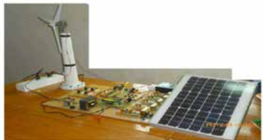
Fig.2 Experimental Setup of Hybrid Wind-solar Power System

The hardware of Solar PV Wind hybrid energy system is implemented and the output is fed to the load is shown in fig.2.. The current and voltage values from the wind turbine, solar panels, battery group and load are measured in the implemented system. Production and consumption of power for each module are calculated.