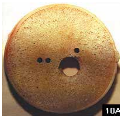
Helical blade: impaction causes bone compaction

Retards rotation & prevents varus collapse