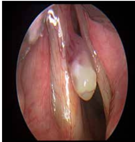
Vocal cord Polyp