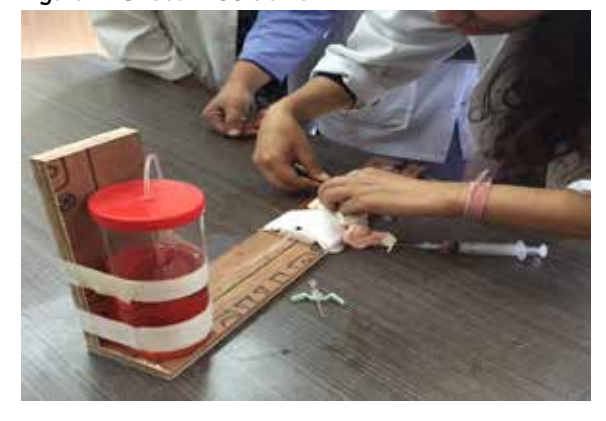
Figure 2 : Girebu PICC trainer training session