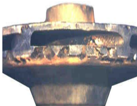
Fig. 2 Cavity Produce in parts.

Undesirable flow conditions caused by obstructions or sharp elbows in the suction piping Sharp elbows, valves, other fittings and obstructions cause more frictional pressure loss in the pump suction, thus increasing possibility of low pump suction pressure leading to cavitation.