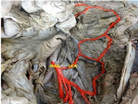
FIG. 2: Left colic artery (LCA) arising from IMA

artery, sigmoid arteries and superior rectal artery which is a downward continuation of inferior mesenteric artery. In the present study the left colic artery arose from the inferior mesenteric artery in all the 50 cadavers and divided into ascending and descending branches (fig:2).