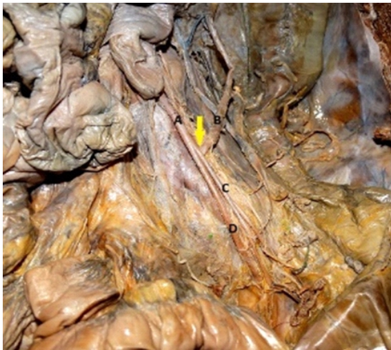
FIG.3: Yellow arrow – LCA and sigmoid trunk shows common origin (A – IMA, B – LCA, C – sigmoid trunk, D – superior rectal artery)

The sigmoid arteries also were present in all the 50 cadavers. The number of sigmoid arteries varied from 2 to 3. The origin of sigmoid arteries was as follows- a single trunk arising from IMA as sigmoid trunk and dividing into 2 or 3 branches (fig:4) or sigmoid trunk arising in common with left colic artery (fig:3) or 2 or 3 sigmoid arteries from IMA directly (fig:5).