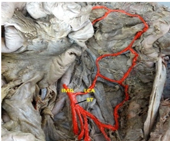
FIG.4: LCA and sigmoid trunk arising separately