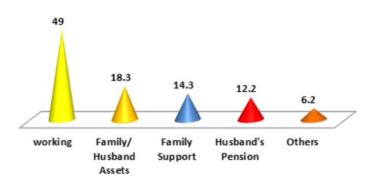
Figure 2: Source of income among sample women

Fig 2 indicated that many sample women were working in private or government sector which was sole source of income for them. Some sample widows used family/ husband's assets to run their household. Nearly 12.2% of sample women were dependable on husband's pension. Few women were running their boutiques or doing small scale business to meet their both ends.