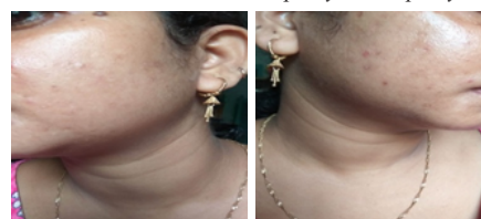
Figure - 7

This time her face was free of Pidika . No medicine was prescribed. She was asked to maintain and follow pathya and apathy .