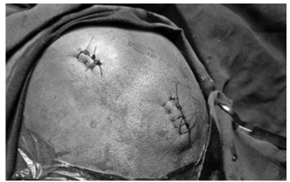
Fig 9: Wound debridement was done. One of the pellets was deeply impacted into the frontal bone and the other one in the deeper layers of scalp.

Chest X ray, X ray of upper limb and lower limb, was suggestive of foreign bodies. The foreign body was removed from the skull during the surgery. Post operatively patient was started on broad spectrum antibiotics and discharged after 5 days. The patient was followed up every 3 months. Patient presented to us after 6 months. There was swelling in the chest wall, around the pellet which was tender. The patient complained of pain, around the swelling in the chest, while lifting weight and doing day to day activities. The pellet had to be surgically removed.