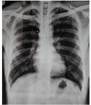
Fig 5: Chest X ray showing tiny opacities in upper and lower zone on right side.