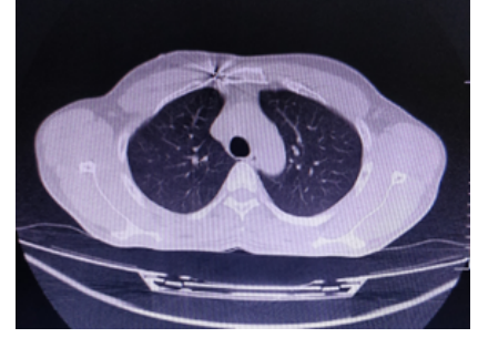
Fig 8 : CT Chest confirming the presence of trajectory of the bullet to the chest wall only.

Surgical management of debridement and removal of foreign body was planned. During preparing the patient for surgery, small abrasions and bruises were found on chest, right forearm, skull and left leg.