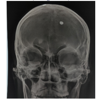
Fig 4: X ray Skull depicting opacities in the frontal bone .

Fig 3: Wound on the chest (on right side) and to the left lower limb