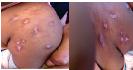
AFTER TREATMENT: 3 rd follow up (after 2 months), 4 th follow up (after 3 months).