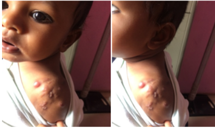
DURING TREATMENT: 1st follow up (after 15 days)