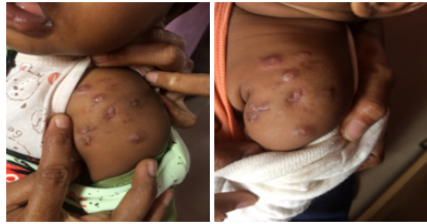
2 nd follow up (after 1 month).