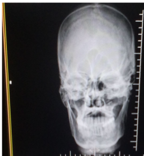
Figure 2: 55 years, female Antero-posterior view of the skull showing sagittal suture.