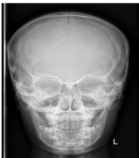
Figure 1: 21 years/Female Antero-Posterior view of the skull

An antero-posterior view and postero-anterior view of the radiograph of the skull shows the Sagittal, Coronal and Lambdoid sutures 1, 2,3. Plain film radiography is a cost effective method in evaluating skull fractures, sutures and vascular grooves 8.