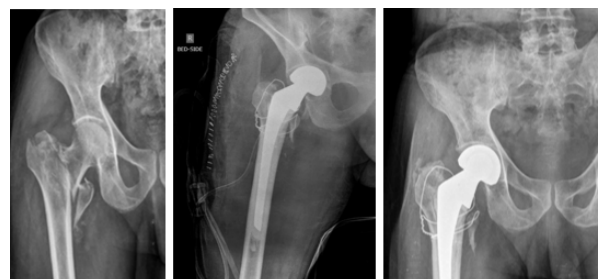
Fig 2: Preop xray post op xray 1 year followup xray