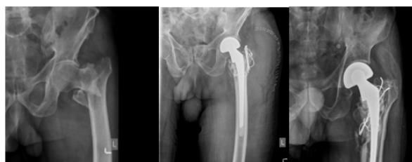
Fig 4: Pre-op xray post op xray 1 year follow-up xray