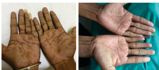
Figure .1 showing palmar syphilide before and after injection benzathine penicillin