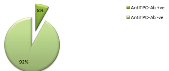
Table1: Distribution Of Cases According To Anti-Tpo- Ab Status

most of the women were in the age group of 23-27 years. Mean maternal age in our study were 26.6±3.73 years in anti TPO- Ab positive group and 25.07±3.34 years in anti TPO- Ab negative group.