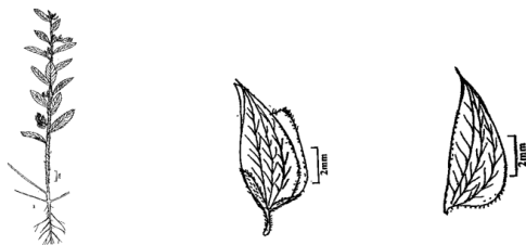
Fig. i. a) Twig

1. Stem and racemes not dichotomously branched above; wing sepals asymmetric elliptic – oblong, obtuse and mucronate at apex (Fig. i.a, b,c) ... P. arvensis