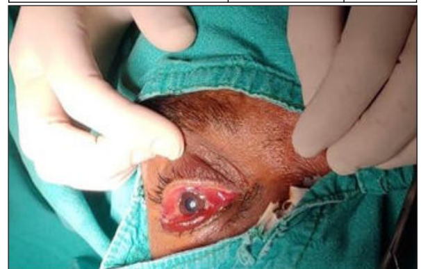
Fig No.1 : Right Eye Of Patient Showing Conjunctival Chemosis & Mid-dilated Pupil.