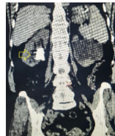
Figure 1 : CT KUB depicting large pelvic Calculus (arrow) on the Right side

pelvic calyceal anatomy CT urography was advised in all patients.