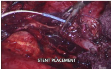
Figure 3 : DJ Stent being placed

The first step was the identification of the psoas muscle after which the ureter was identified just above and medial to the psoas tendon. The ureter was then traced upto the pelvis. Pyelotomy was made using an Endo knife which was extended by the use of endo scissors. The stone was dislodged and retrieved using cup forceps and the pelvis was then thoroughly irrigated. DJ stent was then placed across. The Pyelotomy was closed using 4 O polyglactin sutures. A drain was kept and the post sites were closed back.