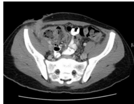
Figure 3: CT scan 6 weeks later showing complete closure of the fistula.

We continued to treat him conservatively with parenteral nutrition, intravenous antibiotics and regular dressings of the wound. He responded well to the conservative treatment with complete closure of the fistula in 4 weeks (figure 3).