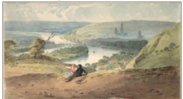
Image 3: Water color painting of Britain

After Pen and Ink era, water color started to dominate the world of painting. The application of color in a visual representation was an evolution at that time period. More people started to show their interest in creating water color painting, hence the commercial preparation of water color elements started. During the 1780s, the water color pigments were very costly and only a few with good financial background could only use the medium. Slowly, the production increased and water color were available in plenty. Painting using water color became a hobby to several people and their outing with color and canvas became a habit. Exhibition of water color painting became a part of club affairs and people in modern countries like England enjoyed the visual representation through this color medium. Public Exhibitions of these works started to become a commercial affair and good artists and painters became celebrities. Paintings were purchased by royal people and decorated them in their homes and commercial establishments. These water colors started to become a lifestyle accessory of every household, hotels, offices, club houses, entertainment zones etc. Children today use water color for their drawings in the school life and is an exciting part of their curriculum.