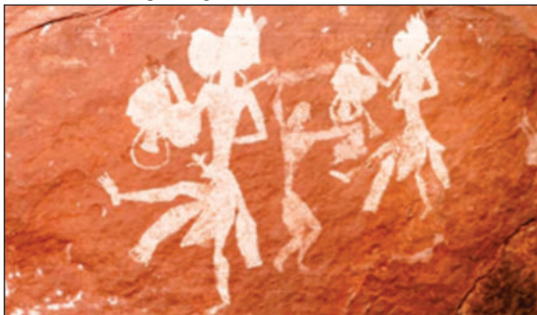
Image 1: Rock Painting on Panchmarhi hills

Visual representation of elements have always attracted people all over the world. In a house, when a small child encounters with a chalk or a pen/sketch pen, he/she roughly draws something on the walls. Similarly, human being in the earlier period also expressed their imaginations on the rocks with different medium like charcoal, ashes etc. in the caves, where they lived. The evolution of Indian painting started around 30,000 years ago, which can be seen in places like Bhimbetka Cave Painting, which is located in Raisen district in Madhya Pradesh. Similarly in other places like Panchmarhi hills also, these kind of pre-historic art work can be seen. As time progress, many new technical mediums emerged one after another that created excellent arena for paintings in India.