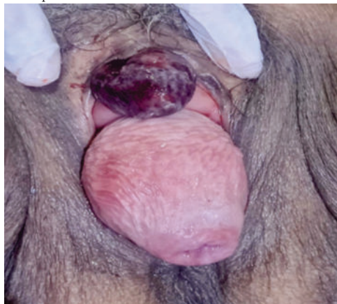
Figure 1. Photograph of urethral prolapse on admission.

A 75-year-old female patient presented with complaints of mass per vagina for 3 years. Patient also gives History of Obstructive LUTS for 6 months. H/o of burning micturition for 10 days. History of associated with Bleeding Per vagina for 1 week. No h/o chronic Cough or constipation. Patient attained menopause 25 years back. Obstetric history-patient has 6 children; P6L6A1, previous 6 Full term normal vaginal delivery. On examination, we found a tender blackish globular doughnut-shaped mass (5 x 3 cms) protruding from vagina, mass bleeds on touch. Our per vaginum examination also revealed Grade 4 uterine Prolapse/Procidencia.