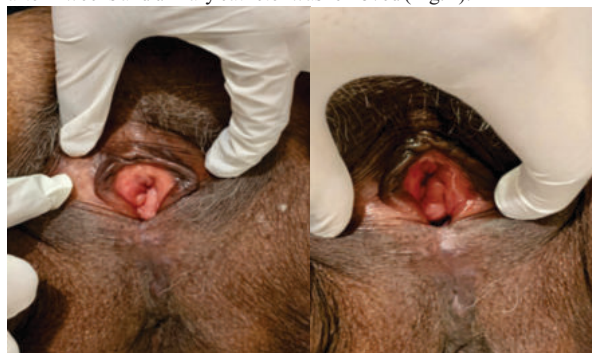
Figure 4. Photograph-2 weeks post-management of the urethral prolapse.

The catheter was left in situ for 2 weeks before being discharged. After then she started applying Evalon (oestrogen) cream, a conjugated oestrogen cream, twice per day for 2 weeks. Patient came for follow up after 2 weeks and urinary catheter was removed (Fig. 4).