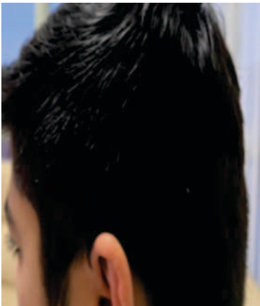
Figure-8 (After Treatment)