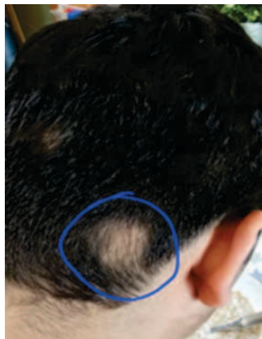
Figure-3 (During Treatment)