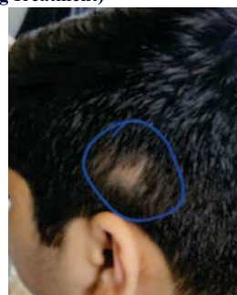
Figure-5 (During Treatment)