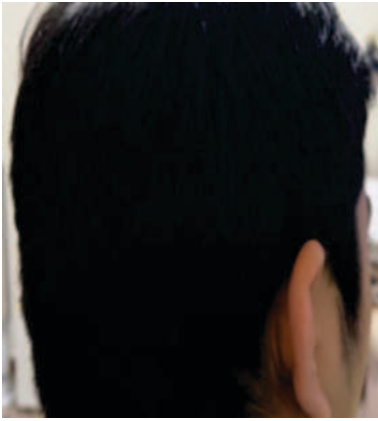
Figure-6 (After Treatment)