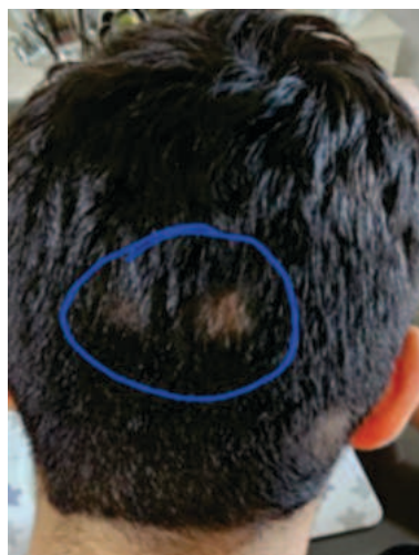
Figure-4 (During Treatment)