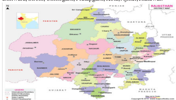
Fig.1. Representing the different districts of Rajasthan

Rajasthan State, especially the districts adjoining and on the verge of Aravalli namely Udaipur, Dungarpur, Banswara, Rajsasamad, Bhilwara, Sirohi, Chittogarh, Pratapgarh, Kota, Ajmer, Jhalawar.