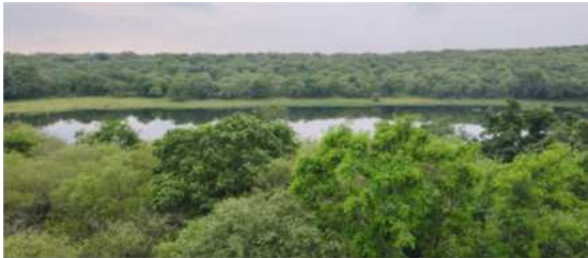
Photograph - Crocodile Century in Chambal at Rawatbhata, Chittorgarh

Due to mining activities in the Aravali Range, animals like Leopard and Beers are transiting themselves to the residential areas for their survival. Recently many cases happened near Gogunda village in Udaipur District and nearby areas where leopards were found roaming in the villages and harming almost 12 livelihoods as per the local news available. Especially, the animals like leopard, beer, chimpanzees and others are the most sufferers.