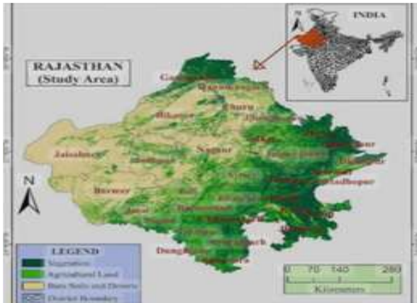
Fig.4. Representing the impact of mining industry on environment