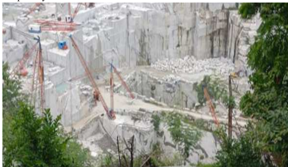
Fig.5. Photograph Showing The Land Degradation During Mining

Further, more leases have been allotted to the new areas in the last couple of years.