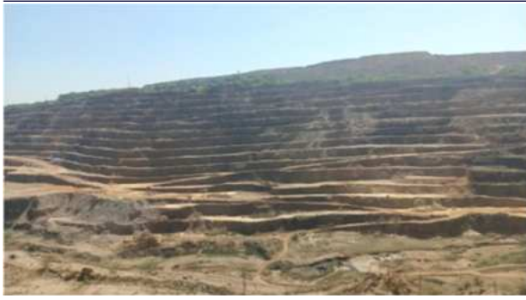
Photograph - Rock Phosphate Mines at RSMM Jhamarkotra, 2023