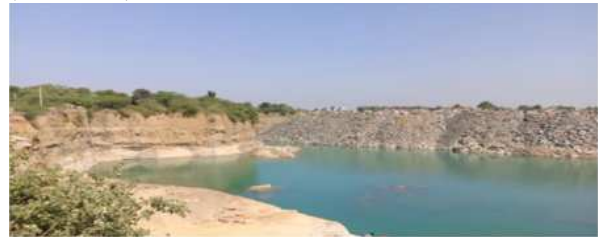
Fig.6. Photograph showing after the closure of mines-land Degradation Devgarh Kakrod, 2022.

Area Approx. 350 Acres Agariya, Rajsamand 2023