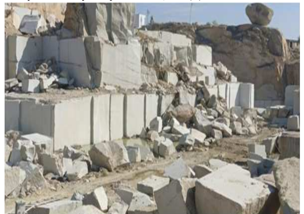
Fig.9. Photograph showing Abandoned Mines and Overburden Dumped Devgarh, malkot, 2023