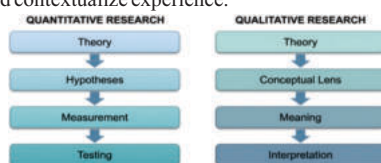
Figure-1: Role of Theory in Quantitative vs Qualitative Research

A key distinction between paradigms concerns the purpose of theory. Quantitative traditions use theory to derive hypotheses that can be tested empirically. Qualitative traditions use theory to interpret meaning and contextualize experience.