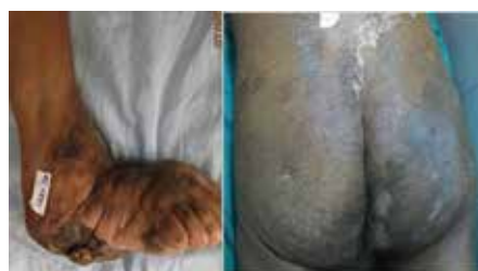
Figure2:Warty tuberculosis on sole, Scrofuloderma on buttock