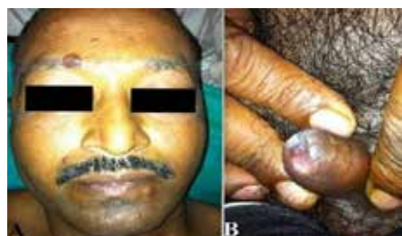
Figure1:Lupus vulgaris: soft erythematous nodule on face with ulcerative lesion on glans penis in same patient