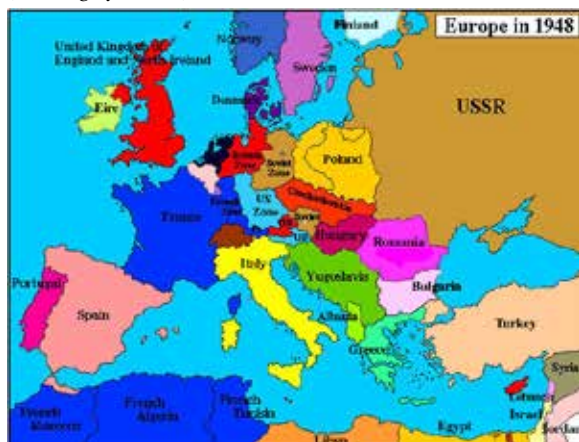
(Figure6): Europe after the world war II