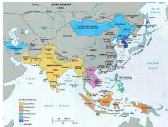
(Figure 7): East and Northeastern of Asia in 1918

Asian continent was divided among several great powers like the other continents (figure 7). Russia had occupied Siberia and parts of central Asia and far east, England had occupied India, Burma, Malaya, Singapore and Hong Kong, French had occupied Indo-China, Dutch had occupied Current Indonesian, Portuguese had occupied Timor, Goa (India), Macau (China Coast); and finally America had occupied the Philippines. Japan administered Korea and Taiwan (Mirheidar, 1389 : 40).