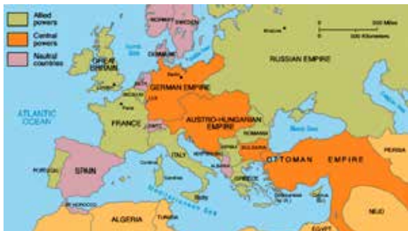
(Figure2):Europe before the world war I