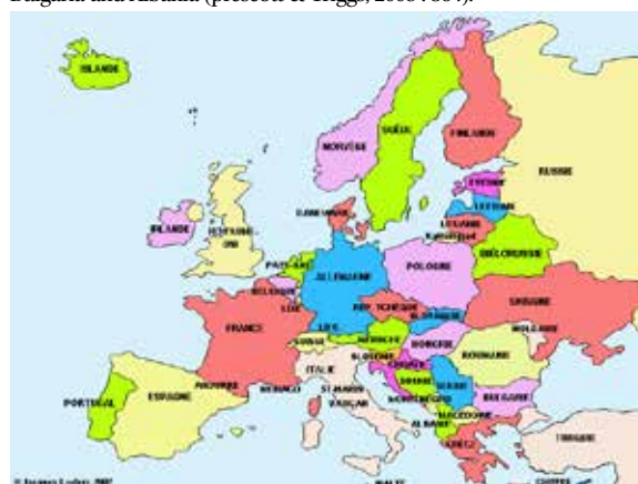
(Figure 5): boundary changes in eastern Europe during and after World War II

was transferred from one country to another! There were two other minor territorial alterations. Romania, having lost Bessarabia to the Soviet Union, also forfeited southern Dobrogea to Bulgaria. Most of Italy's gains along the Adriatic coast in 1920 were lost to Yugoslavia. The Soviet Union encouraged the establishment of communist governments in the band of countries from the Baltic Sea to the Adriatic Sea, consisting of Poland, Czechoslovakia, Hungary, Romania, Yugoslavia, Bulgaria and Albania (prescott & Triggs, 2008 : 364).