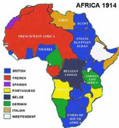
(Figure4): Africa before the world war I

tional boundary (Figure 3). (prescott & Triggs, 2008 : 299).