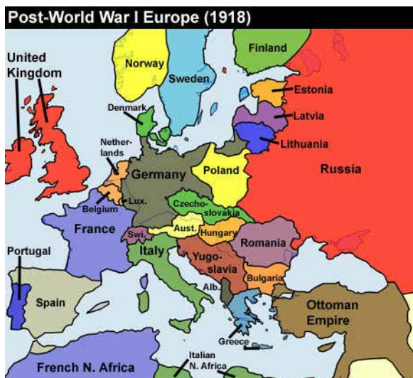
(Figure3):Europe after the World War I

In 1918 the victorious powers were allocated mandates over Germany's African colonies. France secured the eastern parts of Kamerun (Cameroon) and Togoland. Britain occupied the western parts of Kamerun (Cameroon) and Togoland and Tangayika. Belgium was rewarded with mandates over Burundi and Rwanda adjacent to the Belgian Congo. They had previously been part of German Tanganyika. South Africa obtained a mandate over German Southwest Africa. By the Treaty of London of 26 April 1915, Britain and France had assured Italy that if their territories in Africa were augmented after the war, Italy could receive some equitable compensation. In 1924 of the Italian Somaliland boundary with British Kenya was moved about 125 km westwards of the Juba River that had previously been the interna-