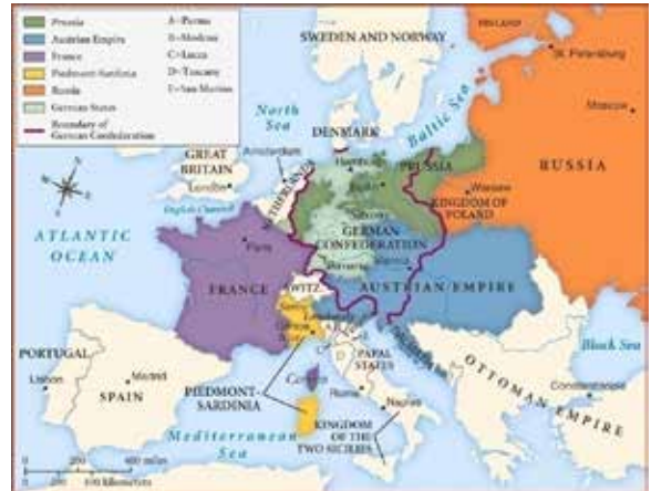
(Figure 7): Map of Europe after the Congress of Vienna in 1815-1839