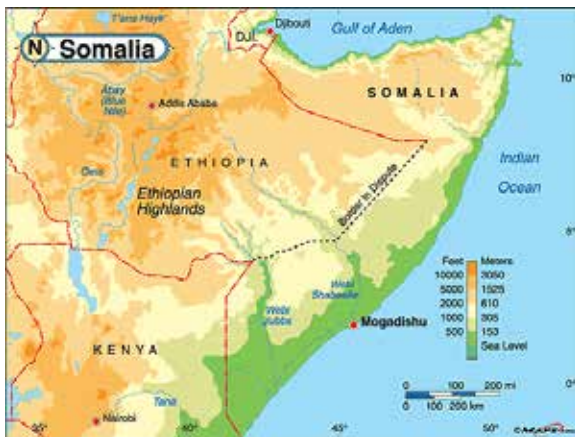
(Figure 1): Ethiopia Ogaaden area where is disputed with Somalia

Different nations are united artificially and civil wars spread, such as Nigeria in West Africa that was a costly civil war in 1967. When Ibo tried to break away the central government and form an independent country called Biafra.