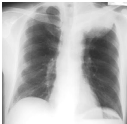
Figure-1 : smooth-contoured opacity with a 9-10 cm diameter in the left upper zone

some rosette like structures are seen. In the immuno-histochemistry of the tissue bits was positive for vimentin, BCL-2 and weakly positive for NSE. IHC was negative for CK, AE1, CD99. These pathological examinations confirmed the diagnosis pulmonary blastoma. He was subsequently referred to cardiothoracic surgeon for resection.