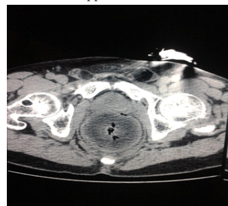
Figure 1: apple blocked between the bones of the pelvis.

All authors contributed to the writing of this article. The authors also state that they have read and approved the final version of the article.