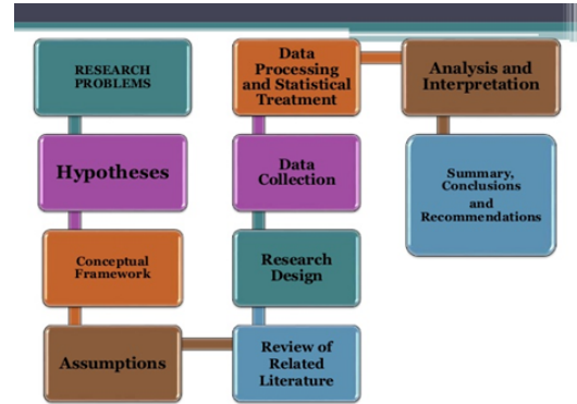
Figure 3: Conceptual Framework on the Research Procedural Steps